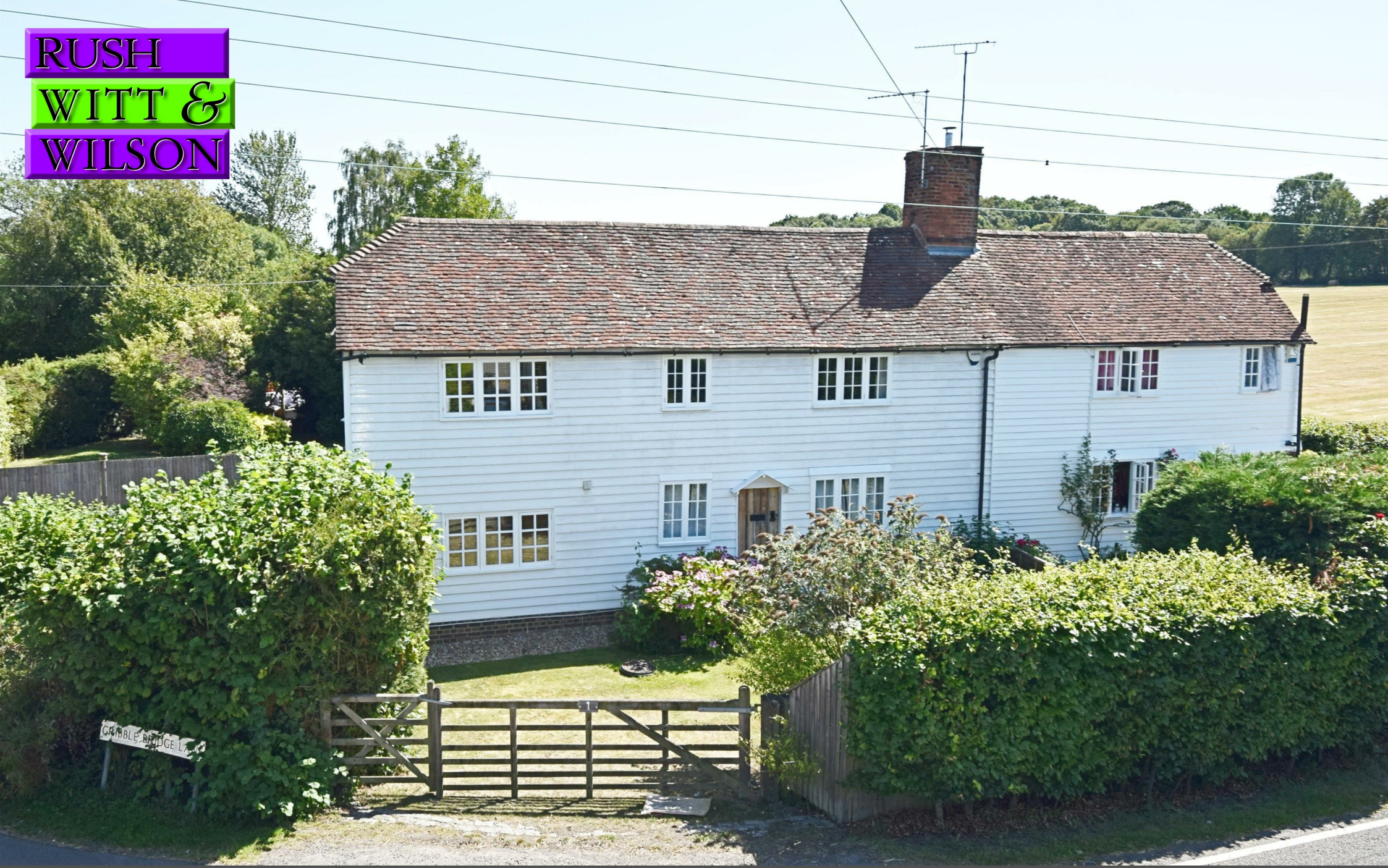
1 Little Mannerings , Biddenden, Kent TN27 8DJ Offers In Excess Of £675,000